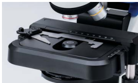
Rackless stage and stage cover