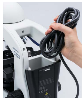
Cable storage compartment