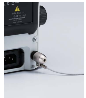
Built-in security slot