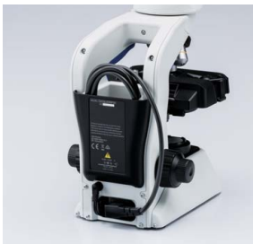
Convenient and easy access power cable storage