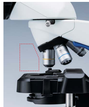
Inward-facing revolving nosepiece