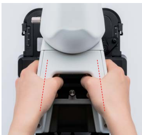
Angled arm enables comfortable carrying