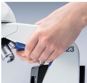
Ergonomic grip for easy carrying