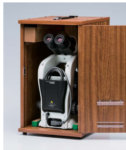
Dedicated wooden case (optional)