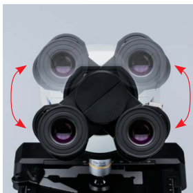
Eyepoint height adjustment