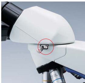
Locking pin for easy binocular rotation